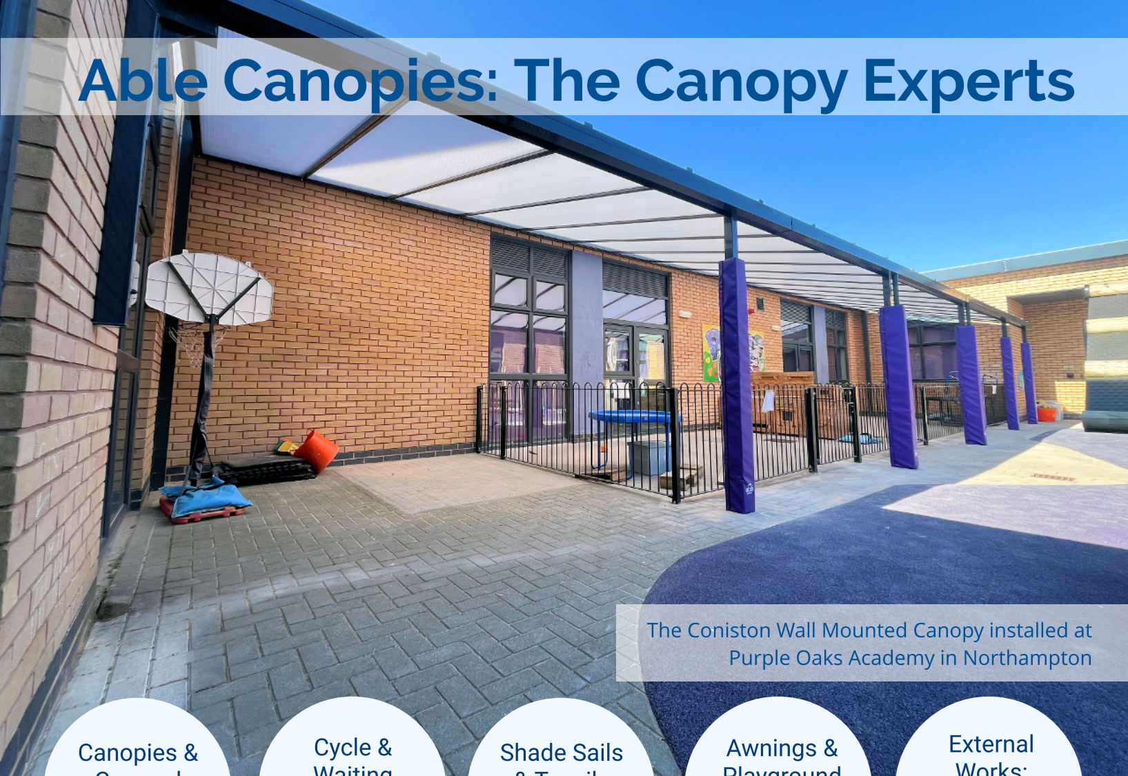
The Coniston Wall Mounted Canopy installed at Purple Oaks Academy in Northampton