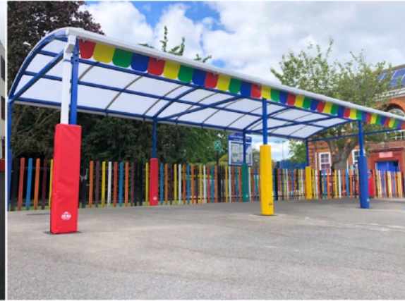
A 10m canopy such as the Welford Dome Junior shown above would receive 6 floor stickers.