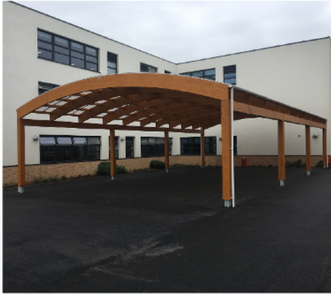
A 33.1m canopy such as the Tarnhow Dome shown above would receive 20 floor stickers.