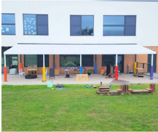
A 12.5m canopy such as the Coniston shown above would receive 7 floor stickers.

The quantity you receive depends on the size of the canopy you order. We will supply enough to enforce social distancing with 2 metre spacings along the length of your canopy. Please see some examples below.