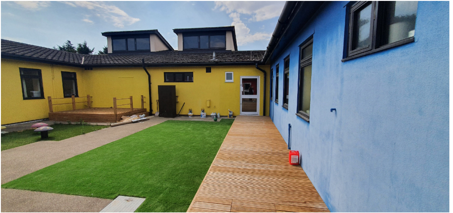
Above: Before canopy installation. Below: After canopy installation.